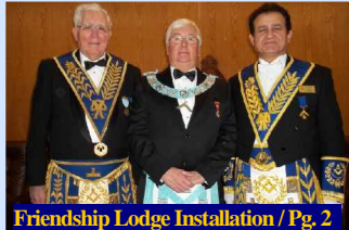
Friendship Lodge Installation / Pg. 2