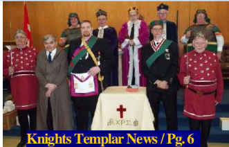
Knights Templar News / Pg. 6