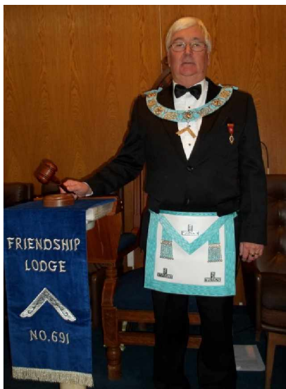
The new Worshipful Master ready to take on the Work.