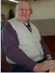
Biography of an unassuming Mason Pg. /5