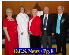
O.E.S. News / Pg. 8