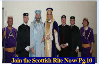
Join the Scottish Rite Now! Pg.10