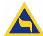
The Symbol of the LODGE OF PERFECTION The Delta enclosing the Hebrew Letter "Yod" as it appears on the fourteen-degree ring.

All degrees are depicted by a Cast of members dressed in colourful costumes. Candidates are active participants in the degree and also wear costumes from the era.