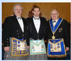
Congratulations & Best Wishes / Pg. 3

We wish them well and pray for their full recovery