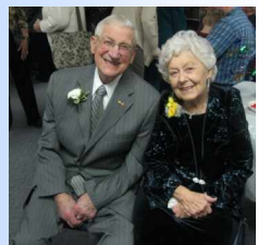
Celebrating 70 years of Marriage / Pg. 4