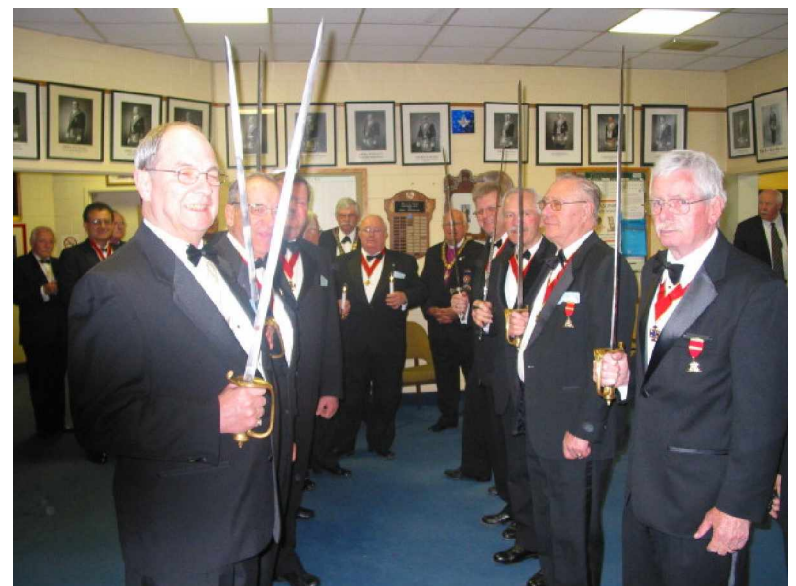
Fourteenth Degree Honour Guard