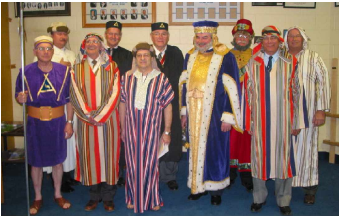
Degree Cast from North Bay prepare to enter the lodge room.

Take your next step in Freemasonry, you might be surprised to find out who is a Scottish Rite Mason.